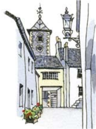
King's Head Court. One of the many yards and alleys leading off Main Street.