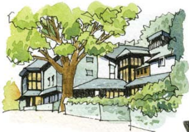
The Theatre by the Lake. Opened in 1999 replacing the old Blue Box Touring Theatre.