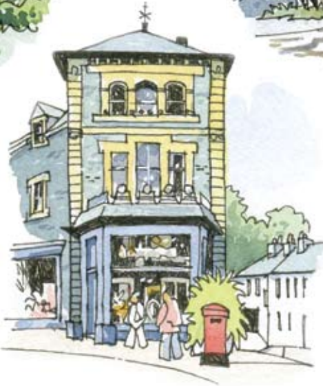
Treeby & Bolton. China shop, gallery and cafe in Lake Road.

So-called because the Keswick Restaurant in Market Square was once a hardware store which sold paraffin stored in a tank in the back alley.