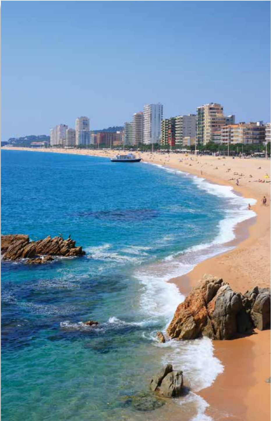
Platja d'Aro beach, Costa Brava