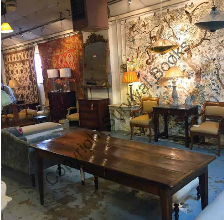
Lots Road Auctions